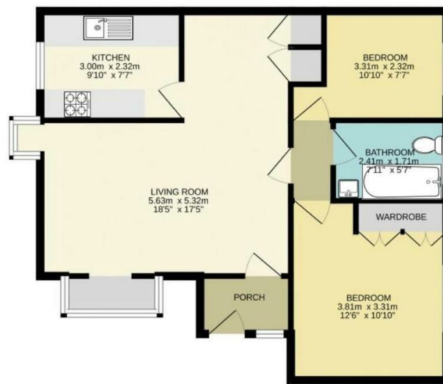
Ground floor 60.2 sq.m. (648 sq.ft.) approx.

Saxon Kings welcome to the market this over 60's retirement semi-detached bungalow. Benefits include on-site warden, laundry facilities and immaculately presented communal gardens. Accommodation comprises spacious lounge/diner, separate modern fitted kitchen, two bedrooms (wardrobes to master) and a bathroom with shower over bath. Chain free. Conveniently located for Epsom town centre and local shops. Lease: 125 Years from September 1985 (approx. 87 years remaining) Service/Maintenance Charge: £373.59 per month.