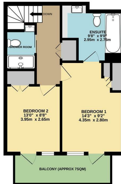
1ST FLOOR 419 sq.ft. (38.9 sq.m.) approx.